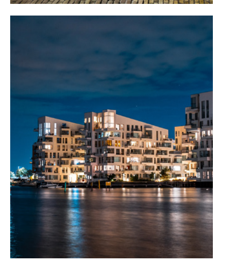
Day 1: ARRIVE COPENHAGEN (D)

Arrive to Copenhagen at own arrangement.